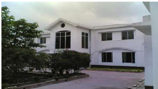
Delhi Public School, Silchar, Assam & Doon heritage school, Champasari Siliguri