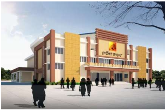
Kushmandi Rabindra Bhawan