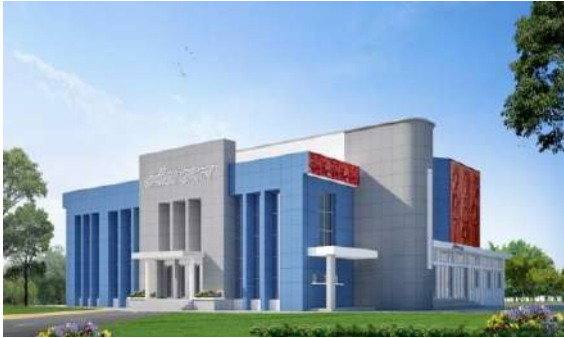
Coochbehar Auditorium(Rabindra Bhawan)