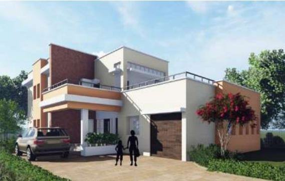
Bungalow for CEO, SJDA,SEVOKE RD