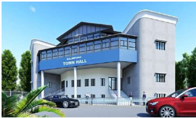
Kalimpong Town Hall(Renovation)