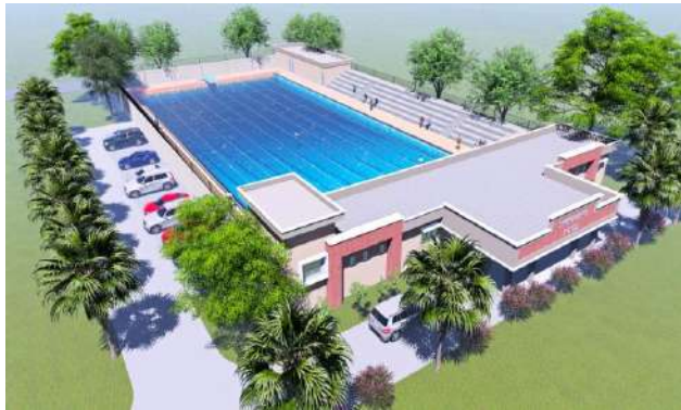
Swimming Pool, Fulbari