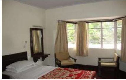
DARJEELING Tourist Lodge