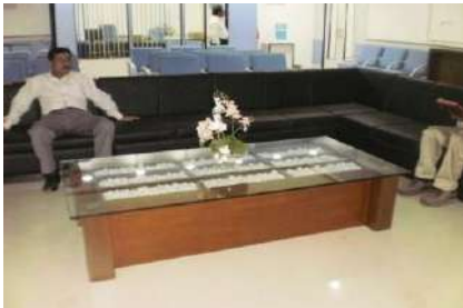
STATE BANK OF INDIA, UTTORAYON Branch