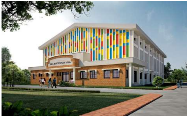
Multipurpose hall, Malbazar