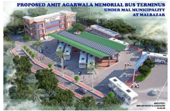
Malbazar Bus Stand